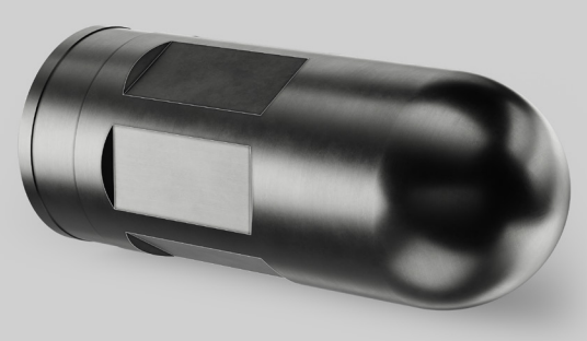
Bull Nose Sub