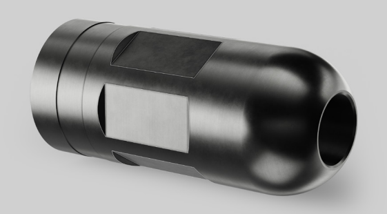
Displacement / Cementing Nozzle