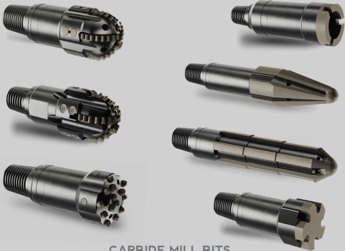
CARBIDE MILL BITS

LiMAR® offers a wide variety of Crushed Carbide and Carbide Insert Mills to cater for almost all Milling and Drilling applications.